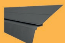
EASY TRAY Unique eaves protection

Suitable for all types of slate, all profiled tiles and metal & corrugated sheeting.