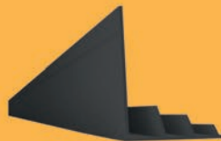
EASY SOAKER Continuous soaker system for slate

Made from the highest grade high impact plastic and incorporating our unique super seals that completely weather proof the roof on a pitch as low as 12 degrees.